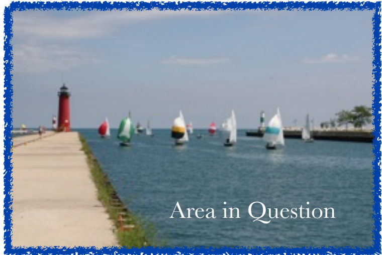
Area in Question