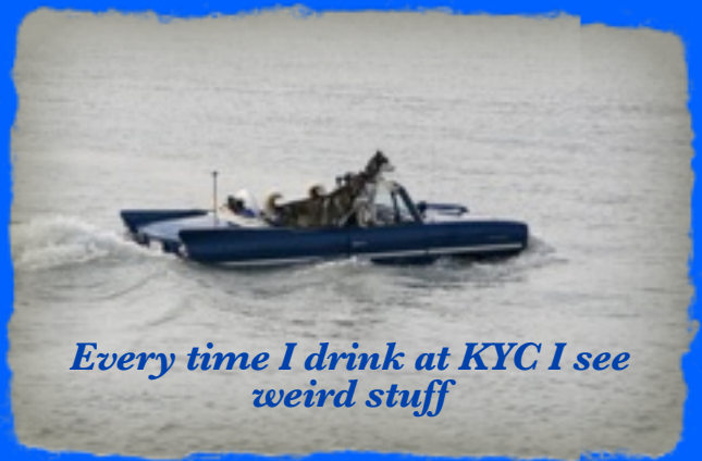
Every time I drink at KYC I see weird stuff