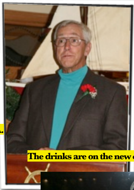
The drinks are on the new commodore