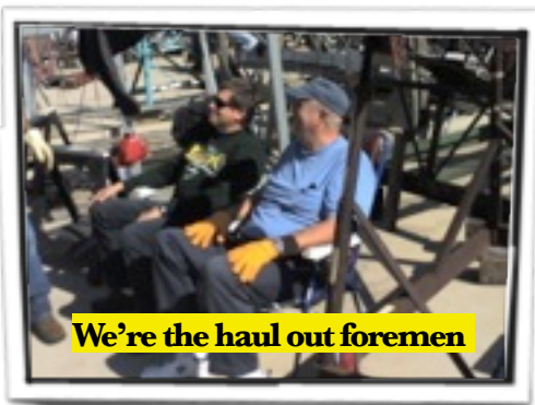
We're the haul out foremen